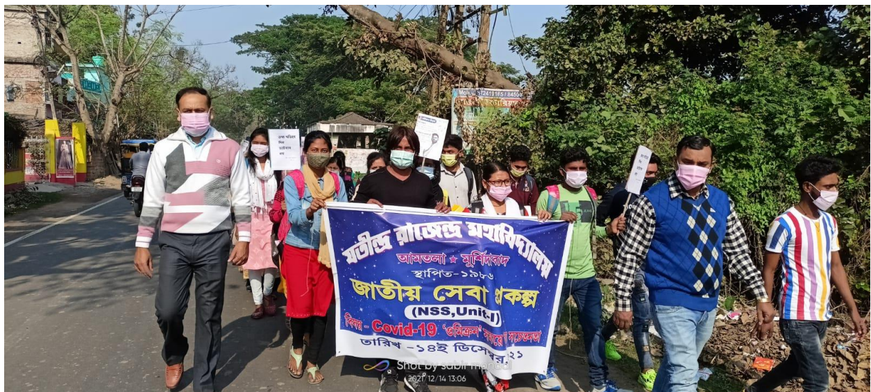
Omicron virus Awareness Road rally