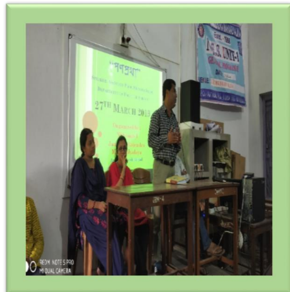
Woman Empowerment picture