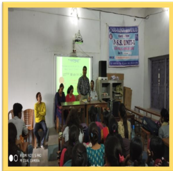
Woman Empowerment picture

Women Empowerment: The discussion on women empowerment is a hot topic in modern society. College unit-1 has discussed on family management , child care ,political empowerment of women as a regular performance during the session 2017 to 2022. This was an effective and influential programme which was able to motivate the girls students.