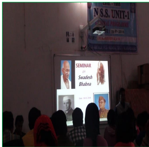
Seminar ON Swadesh Bhabna